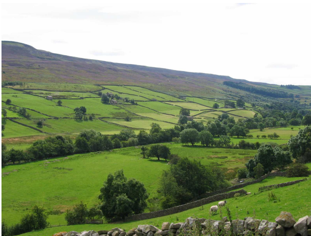
Yorkshire Dales

It is our wish to exchange our own experiences with Farming for Nature and other Green and Blue Services initiatives with the people behind other innovative initiatives that try to combine farming and nature (see Annex 3). Such a meeting may yield valuable recommendations for other initiators, but also regional and national governments and the European Commission.