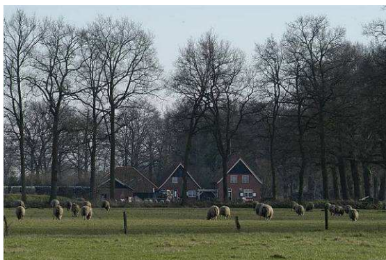
Landscape in the Twickel estate in the East of the Netherlands, home to one of the Farming for Nature initiatives (Alterra)

The search for initiatives in Europe made it painfully clear that so little has been published in English about the Green and Blue Services policy development in The Netherlands. This project was not aimed at a description of the Dutch initiatives, but the initiatives outside The Netherlands. It is recommended, however, that the experience with Green and Blue Services in the Netherlands is made accessible to the scientific community and practitioners in Europe through an English publication. In Annex 2, a summary is given of the Farming for Nature concept. For a more in-depth description of one of the Farming for Nature initiatives is referred to Buizer (2008). The Haaglanden case study report for PLUREL will contain a description of the Green Fund Midden Delfland.