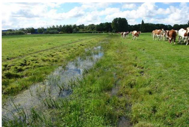
Biesland polder in Haaglanden region, in the West of the Netherlands, home to one of the Farming for Nature initiatives

Landscape is an issue of growing interest both with the public and with policy makers in The Netherlands. It is on the agenda of the ministries of agriculture, nature and food quality (LNV), housing, spatial planning and environment (VROM), and education, culture and sciences (OCW). The Provinces were recently given a greater responsibility with respect to the landscape, including the necessary funds. Green and Blue Services also became a responsibility of the Provinces, as well as the national AES Programma Beheer.